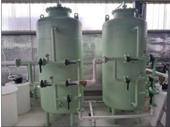
Sand filter (left) + Activated Carbon